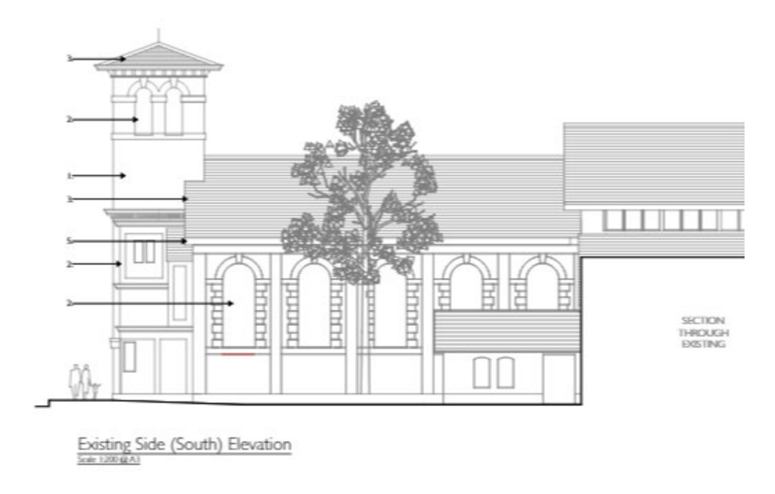
Figure 2: Extract of the existing southern elevation drawing ref. 22.20 PL 007 REV.C