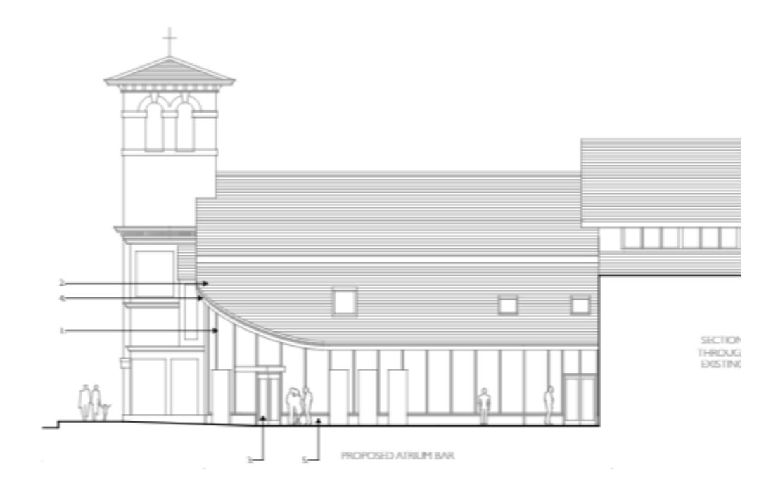
Figure 1: Extract of the proposed southern elevation drawing ref. 22.20_PL_201 REV.C